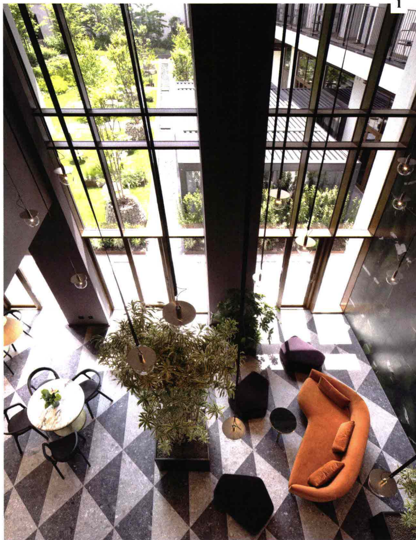
1. THE DOUBLE-HEIGHT SPACE OF THE HALL, RECEPTION AND LOBBY, FEATURING BRAZILIAN MARBLE WALLS AND THE STONEWARE FLOORING. TACCHINI SOFA AND COFFEE TABLE, LA CIVIDINA POUF AND VIABIZZUNO GLASS SUSPENSION LAMPS. AT LEFT, DESIGNER TABLE AND SHE SAID CHAIRS BY MATTIAZZI . THE PROJECT WAS CARRIED OUT BY THE INTERIOR CONTRACTOR CONCRETA . 2. THE LOUNGE. STANDARD SOFA BY EDRA , CINQUANTA ARMCHAIR BY MUSSI , CAGE COFFEE TABLE BY TACCHINI , MARIETTA PENDANT LAMPS BY BOVER . 3. VIEW OF THE INNER GARDEN CONCEIVED AS A HIDDEN OASIS OF PEACE AND RELAXATION TO BE EXPERIENCED AT ANY TIME OF DAY